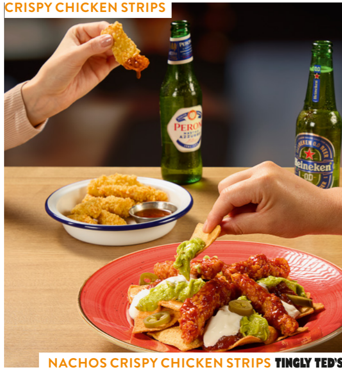
NACHOS CRISPY CHICKEN STRIPS TINGLY TED'S