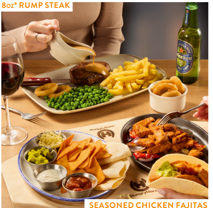
SEASONED CHICKEN FAJITAS

Our rump steaks are aged longer for a fuller flavour and tenderness.