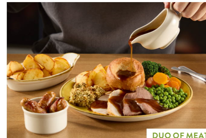
DUO OF MEATS

Hand-Carved Roast Beef (515 kcal / 8.9g Sugar / 1.57g Salt) Hand-Carved Roast Turkey (503 kcal / 8.9g Sugar / 1.57g Salt) Vegetable Tart V (626 kcal / 12.0g Sugar / 1.78g Salt)