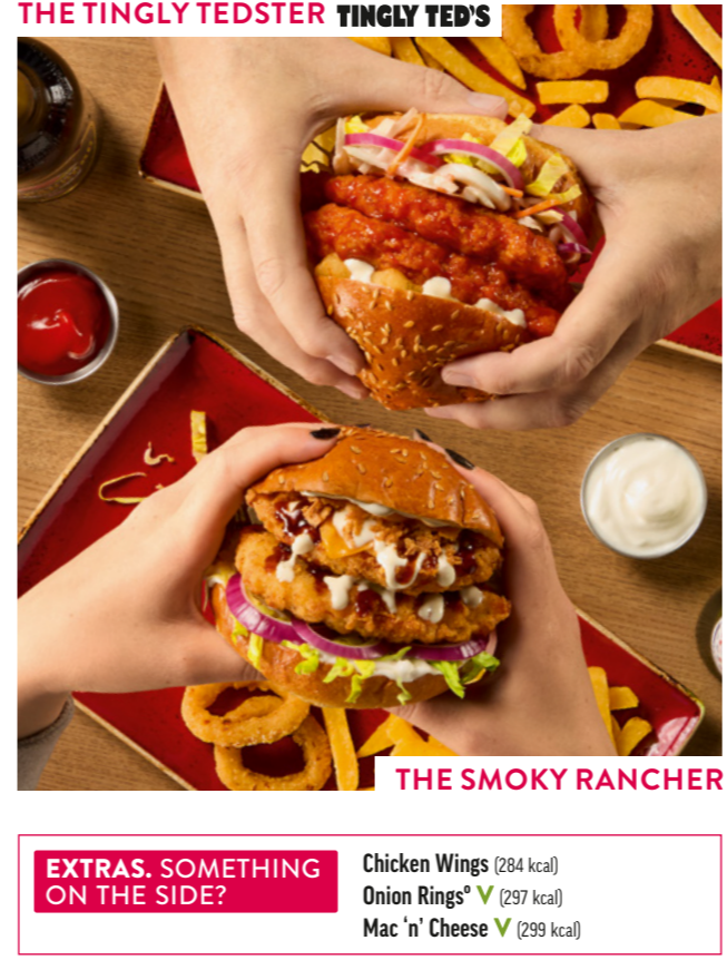
THE SMOKY RANCHER