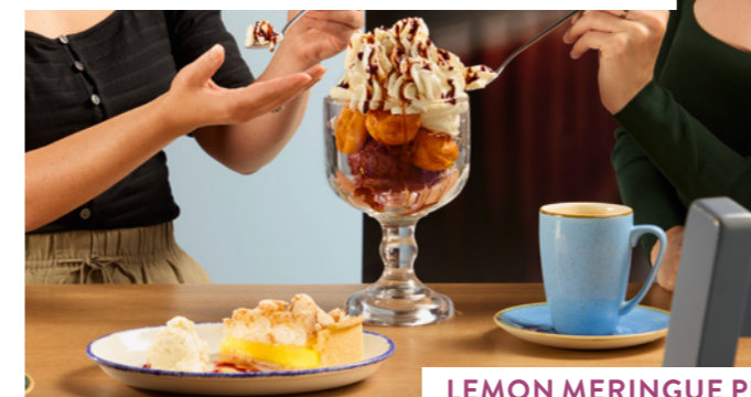
LEMON MERINGUE PIE

Tea? Coffee? Hot choc with all the trimmings? You'll find them all on the drinks menu or tap the app.