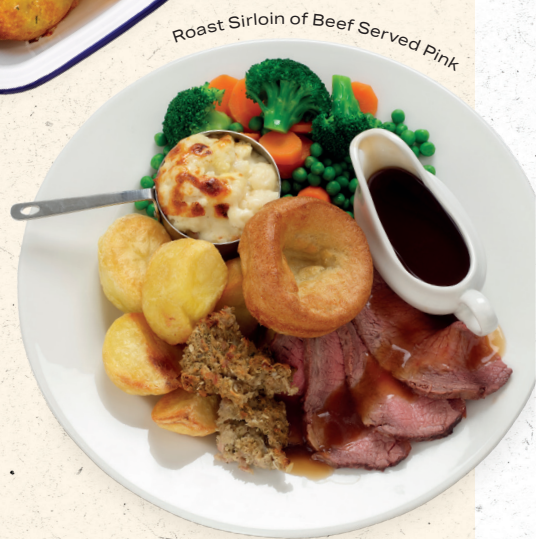
Roast Sirloin of Beef Served Pink