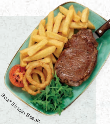
8oz* Sirloin Steak