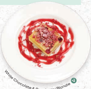
White Chocolate & Raspberry Blondie 🍷