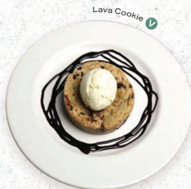
Lava Cookie 🍷

MINI PUDDING & HOT DRINK 🍷 Choose from: Mini triple chocolate brownie (279 kcal) or mini white chocolate & raspberry blondie (253 kcal) with a tea (0 kcal) or Americano (2 kcal)