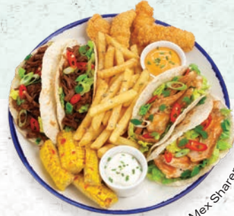
Tex Mex Sharer