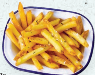
Rosemary Sea Salted Skin-On Fries 🍷

CHIPS 🍷 (428 kcal) ONION RINGS* 🍷 (356 kcal) ROSEMARY SEA SALTED SKIN-ON FRIES 🍷 (381 kcal) BUTTERED MASH 🍷 (323 kcal) BUTTERED BABY POTATOES 🍷 (321 kcal)