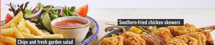
Chips and fresh garden salad