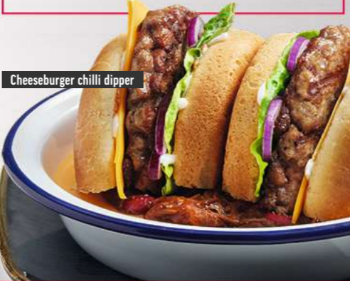
Cheesburger chilli dipper