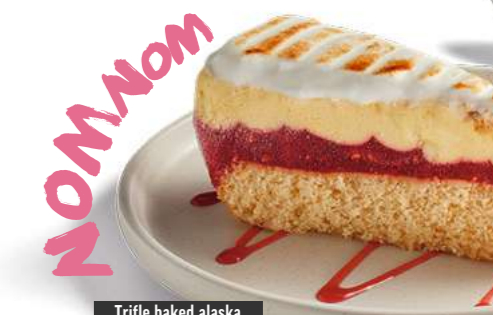
Trifle baked Alaska