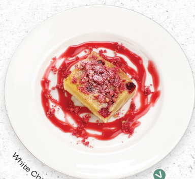
White Chocolate & Raspberry Blondie V

CARAMELISED BISCUIT CHEESECAKE V 5.99 Served with raspberry coulis and clotted cream ice cream (576 kcal) Vegan option available V (563 kcal)