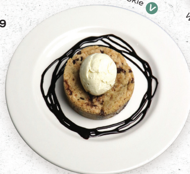
Lava Cookie V