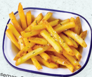
Rosemary Sea Salted Skin-On Fries V